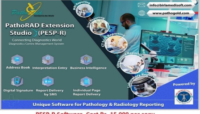
PESP-R Software, Cost Rs. 15,000 per copy

Download Demo: PESP-R installation process